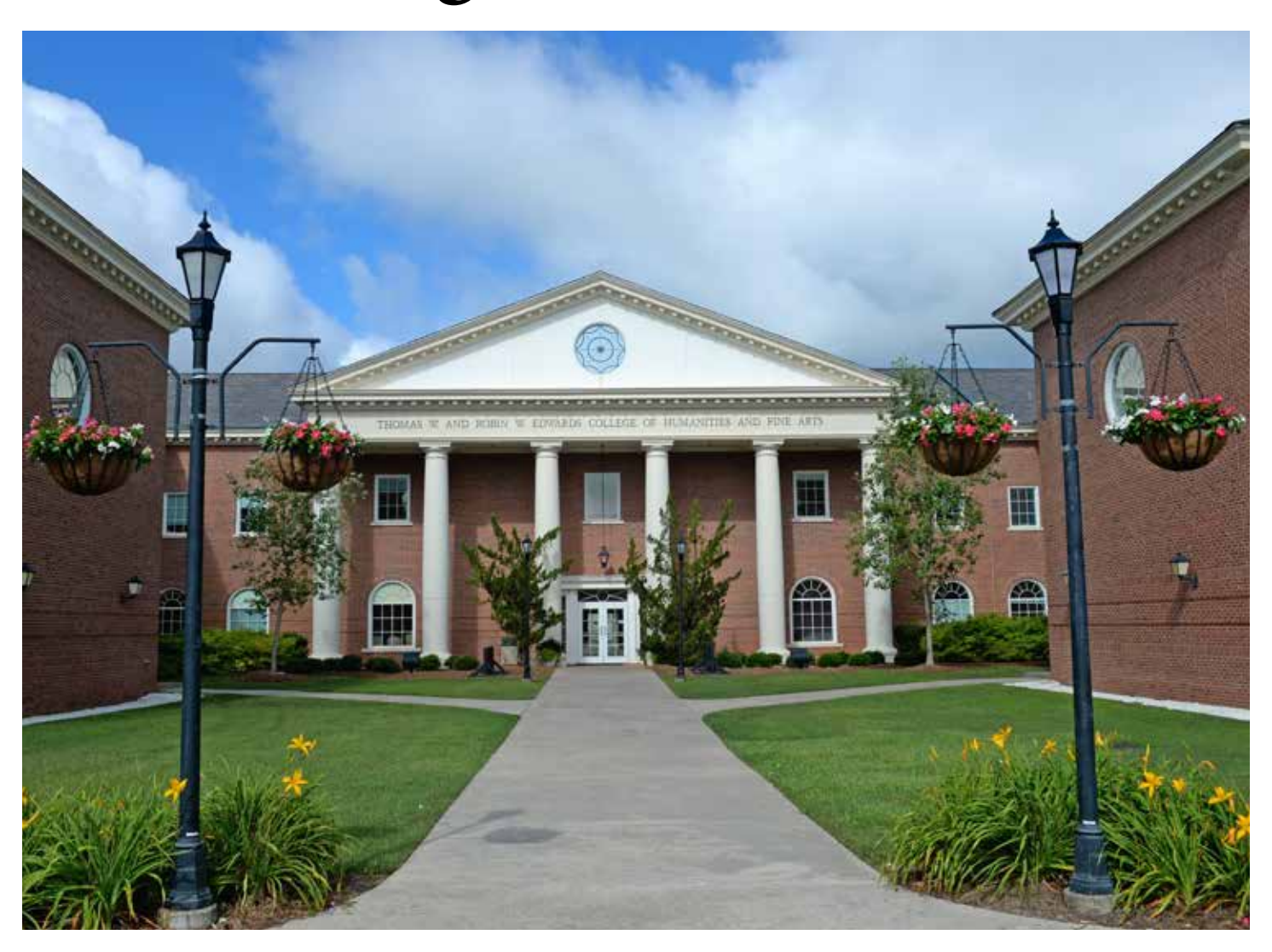
March 30-31, 2018 Coastal Carolina University Conway, SC