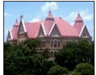
Texas State University

The School of Music of Texas State University is happy to host the 21 st Annual CMS South Central Chapter Conference. Our School is the “home” of more than 500 music majors, who are studying – in Bachelor and Master’s programs – music education, sound recording technology, music performance, jazz studies, music theory, conducting, composition, music history / literature, or pursue Kodály and Mariachi certifications. The 2006 conference will offer opportunities to present papers, lecture-recitals, posters, and music performances.